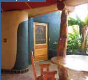
Sunny living room

Tyres make the perfect building material. They are packed with earth, stacked like bricks and plastered.