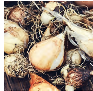
Bulbs ready for planting