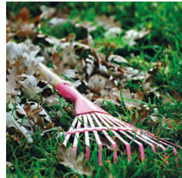
Raking up leaves